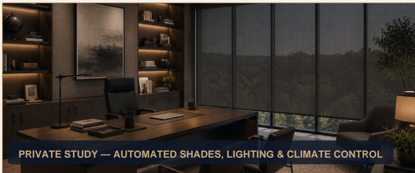
PRIVATE STUDY — AUTOMATED SHADES, LIGHTING & CLIMATE CONTROL