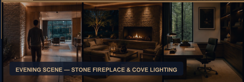
EVENING SCENE — STONE FIREPLACE & COVE LIGHTING